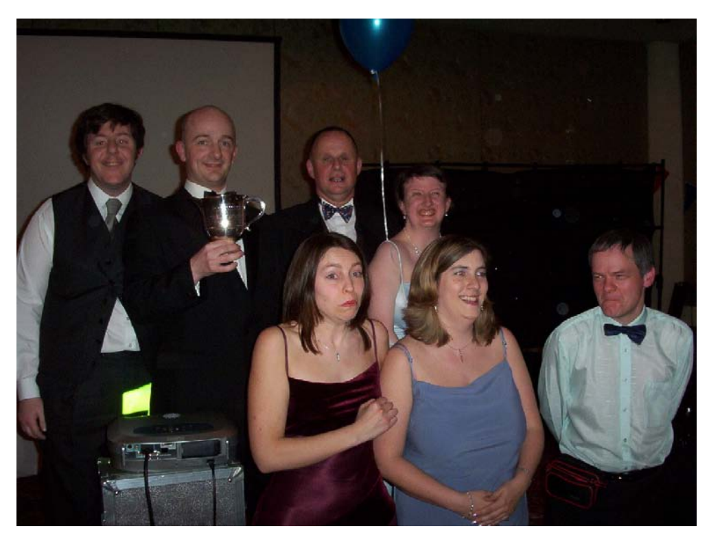
The 64<sup>th</sup> ANC: East Anglia win Best Area the night before the Area Lead option, placing emphasis on Area responsibility and the Internet, gets the delegates' vote