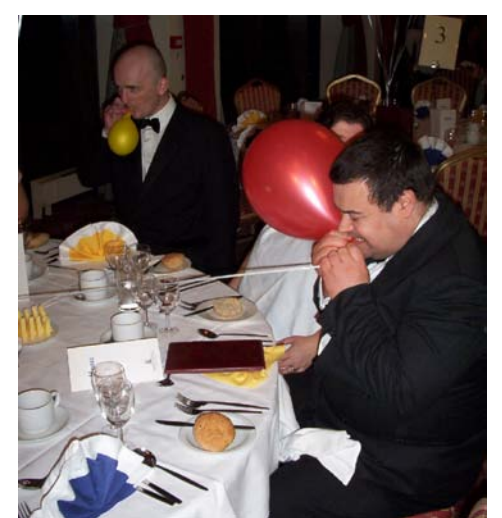
The Essex boys get "high"

We had an eventful journey in. I got a lift, instead of the coach. In the first 5 minutes our chauffeur proved to me, despite the shouts, that red lights are only advisory, as indeed would appear to be the national speed limit. Around then I taught our driver of 15 years what the de-mist symbol was on the car. A new experience of watching gaseous rubber the pass windows the curling in slipstream came next when an articulated truck decided "mirror indicate manoeuvre" applied whether a car was there